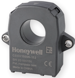
Honeywell CSSV Current Sensor