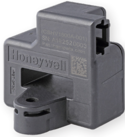
Honeywell CSHV Current Sensor