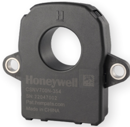
Honeywell CSNV Current Sensor