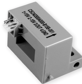
TABLE 2. OPEN LOOP CURRENT SENSOR COMPARISON

Open loop current sensors provide output voltage proportional to measured current without using feedback control. They are often preferred in battery-powered circuits due to their compact size and lower power consumption which can enable longer battery life. This type of current sensor is often used in welding machines, variable speed drives, and overcurrent protection applications.