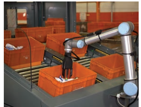
Each picking/item handling