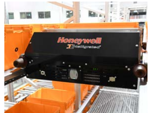
Automated storage and retrieval system