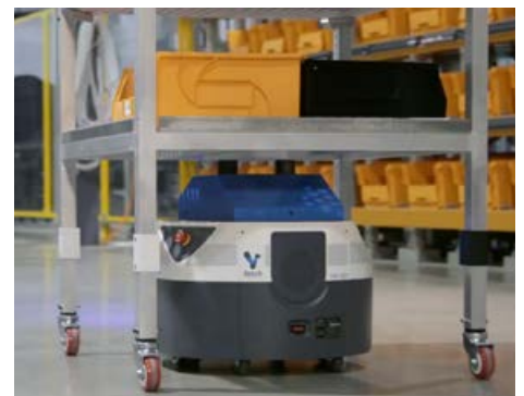
Autonomous mobile robot