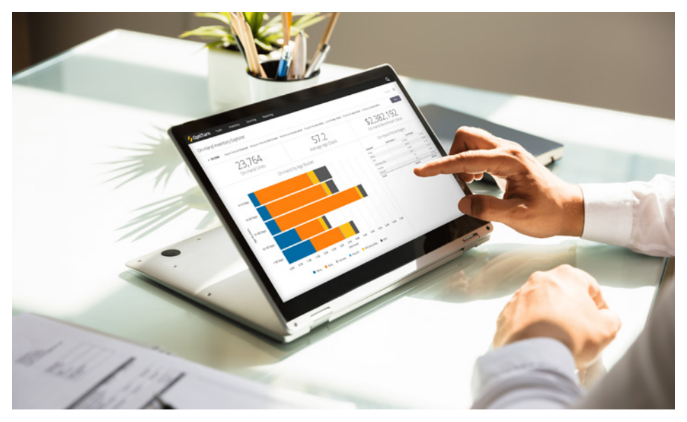
The returns optimization platform of Optoro, Honeywell's leading reverse logistics partner.

According to a Peerless Research Group (PRG) survey, 60% of retailers consider reverse logistics important to their companies. Yet only 32% have any formal corporate position or process for managing reverse logistics operations.<sup>7</sup>