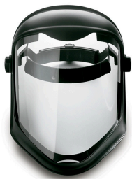
Honeywell Uvex Bionic Faceshield