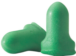
Maximum Lite Uncoded