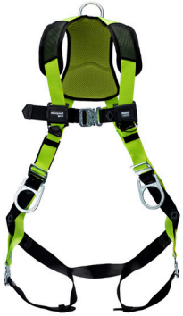
Honeywell Miller® H500 Harness

During a turnaround, workers need to be equipped with comfortable fall protection when repairing structures at height or building new platforms. Whether you need a leading edge or cross-arm harness, Honeywell's cutting-edge, ergonomic fall protection products deliver the comfort and safety needed when working at height for hours at a time.