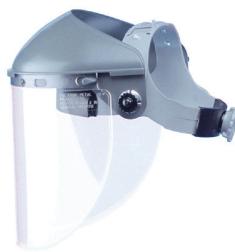
Honeywell Fibre-Metal F400 Faceshield Headgear