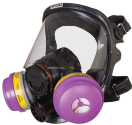
Honeywell North® 7600 Series Full Facepiece Respirator

Honeywell's respiratory protection solutions can help protect against the risk of exposure to toxic gases and chemicals during turnarounds. In more dangerous environments like this, a full facepiece respirator can help protect you from face splashes as well as respiratory hazards, while an escape respirator can help protect workers in the event of an emergency.