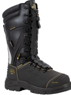
Oliver 65 Series 65791