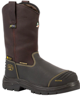
Oliver 65 Series 654935

Turnaround environments may expose your feet to hazards such as punctures, cuts, slips and trips, extreme weather and more. Honeywell's ultimate footwear line of products is created to protect against a variety of risks. Designed to mimic the foot's natural movement, Honeywell's safety boots are comfortable enough to wear all day. Every safety boot and shoe combines innovation, comfort and safety, and is equally effective both indoors and outdoors.