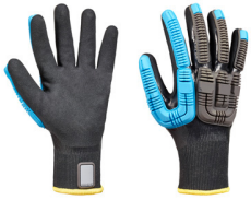
Honeywell Rig Dog™ Knit Water Resistant

When workers are fitting pipes, welding metals or moving materials around in laydown yards, they need high-performance hand protection that helps reduce the risk of hand and arm injuries - especially from “pinch points” and cuts or lacerations. Choose from our impressive range of mechanical safety gloves and cut-resistant sleeves, including color coded options that identify different cut protection levels to make glove selection easier.