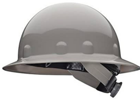
Honeywell Fibre-Metal Full Brim Hard Hat (E1)