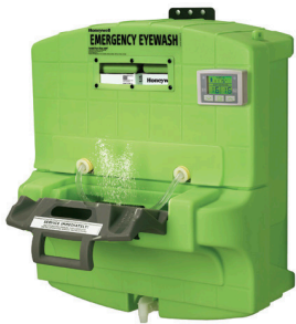
Pure Flow 1000 Double Eyewash Wall Station