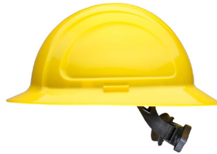
Honeywell North Zone™ Full Brim Hard Hat (N20)