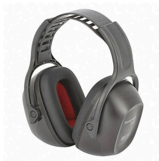
VeriShield™ Dielectric Earmuffs