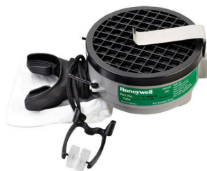
Honeywell 7900 Series Mouthbit Escape Respirator