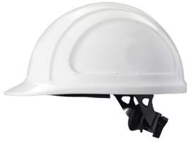
Honeywell North Zone™ Hard Hat Cap (N10)

Head-to-toe protection starts at the top with safety solutions that protect against falling objects. Honeywell offers a broad range of safety headgear options, from wide-view welding helmets to hard hats, designed to protect oil and gas workers when they need it most.