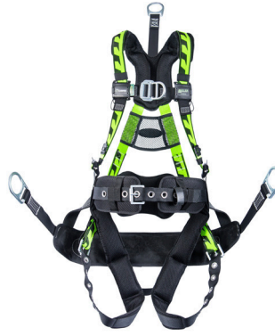
Honeywell Miller® Aircore Harness