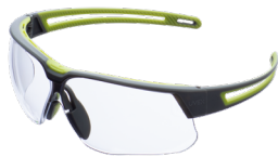
Honeywell Avatar™ Plus

Honeywell's tested eye and face protection products are designed to help increase worker safety and visibility, especially in turnaround environments where there's risk of exposure to dust and airborne particles. Workers can enjoy safety eyewear that provides all-day comfort with a customizable and adjustable fit for every facial profile.