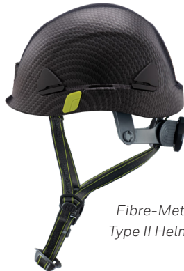
Fibre-Metal Type II Helmet