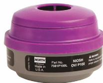
Honeywell Defender Multi- Contaminant + P100 Cartridge