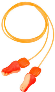
TrustFit® Plus Coded

Conserving your workers' hearing means protecting a vital component of their daily life. Noise around 85 decibels (dBA) can damage workers' hearing after repeated exposures lasting 8 hours or more. When noise reaches 95 dBA, it can put their hearing at risk in less than an hour. Because every worker is unique, there isn't a one-size-fits-all solution.