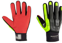
Honeywell Rig Dog™ Xtreme