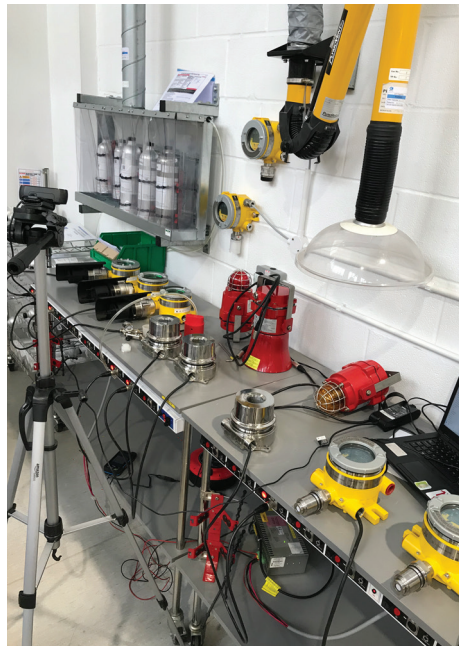
Example: Virtual FAT