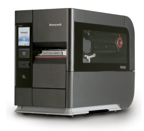
Honeywell PX940 high-performance industrial printer with integrated label verification

The trend toward miniaturization in label printing requires printing on smaller and smaller labels. With a print registration of up to \pm 0.3 mm (0.012 in), PX940 printers can accurately print 900 to 1000 small labels per hour - edge to edge - with high precision. This is an important advantage for automotive manufacturers that often need to label very small parts.